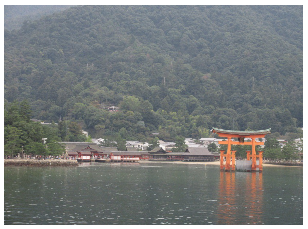
Gate in Water