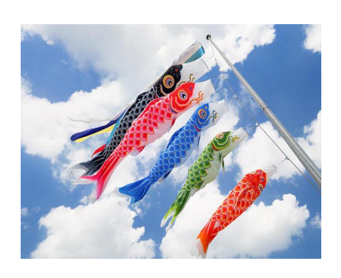
Edo Period (1600—1868)