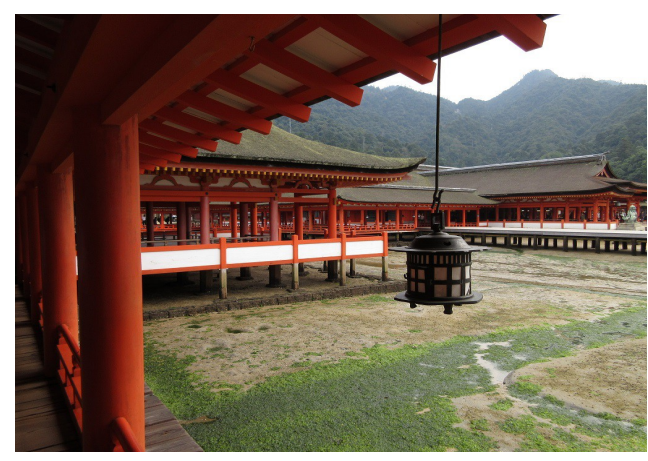
Itsukushima Shrine Built on water by Heike leader Kiyomori Taira, late 12 century