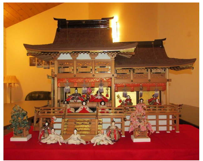
Imperial Palace donated by Wendy Coe