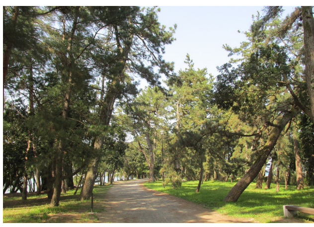
Road on the Bridge

There is a temple at the bottom of the hill where I took a picture of the bridge(left picture above), named Chionji and they displayed several pictures showing Heaven and Hell. Here is the Hell picture(Oni monster is handling human beings like an animals), which reminds me of Russian's invasion of Ukraine.