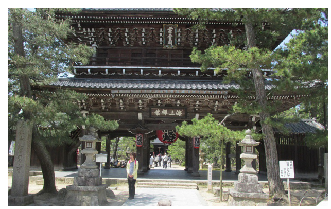
Chiongi Temple gate

There is a temple at the bottom of the hill where I took a picture of the bridge(left picture above), named Chionji and they displayed several pictures showing Heaven and Hell. Here is the Hell picture(Oni monster is handling human beings like an animals), which reminds me of Russian's invasion of Ukraine.