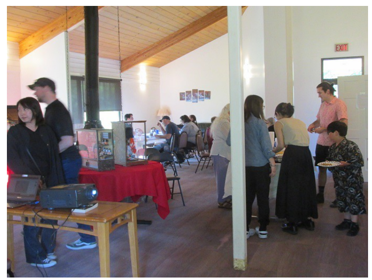
Enjoying the food!!!