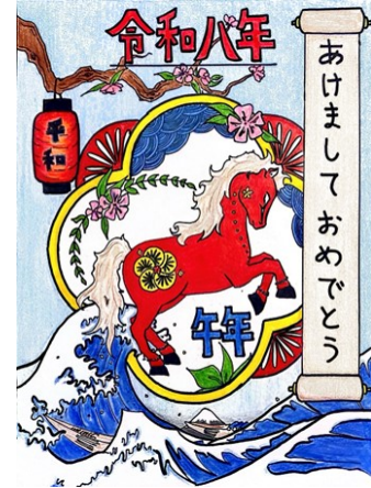
( 3rd )