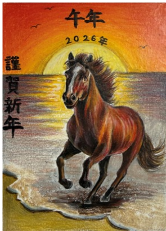
( 4th )