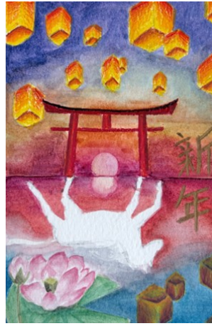
( 5th )