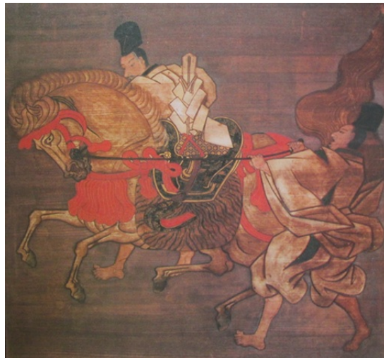
(Painting in Asakusadera, Tokyo)