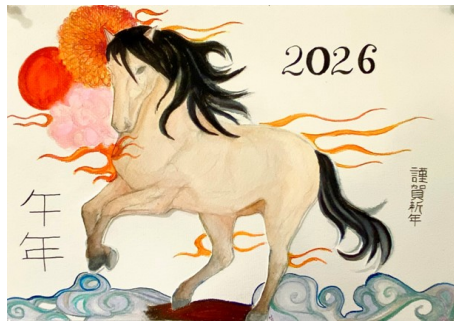
( 1st )