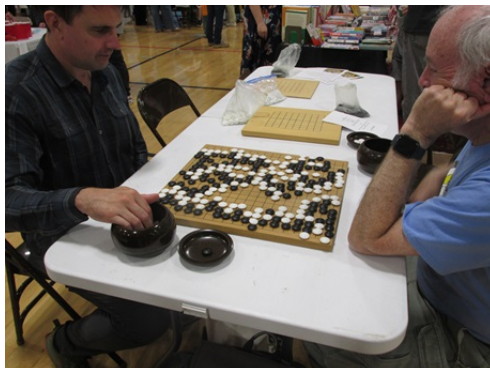
(At Matsuri 2024)

Igo is a very popular game in Japan together with Shogi (Japanese Chess.) Two players will compete the size of their territory gained each other on a board and they fight technically at each other's border. One mistake affect the consequence. Usually it will take more than one hour for one game.