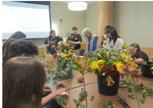
(Students were fast learners)