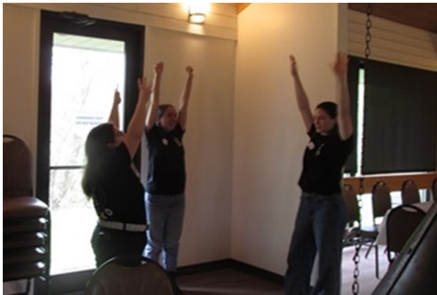
(Players must exercise before performance)