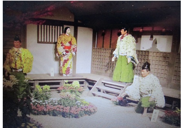
(All the figures are dressed up by live chrysanthemum.)