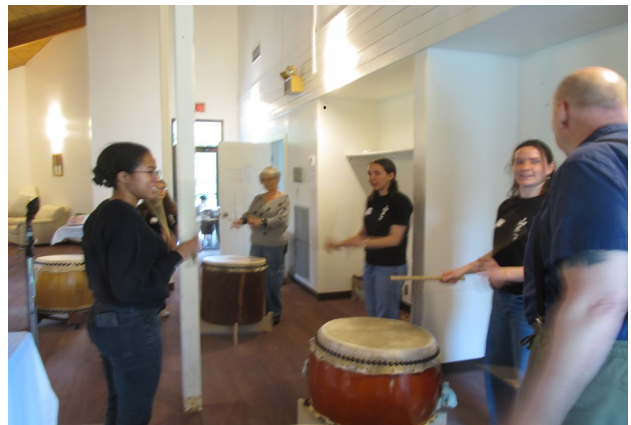
(JASV Members were invited for Taiko banging)