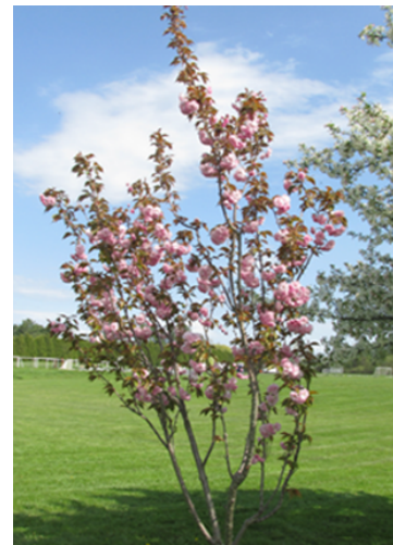
(JASV's Cherry Trees at Veteran's Memorial Park in South Burlington)